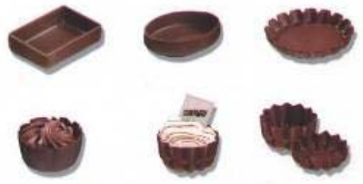
SHELLS MADE ON THE HFM