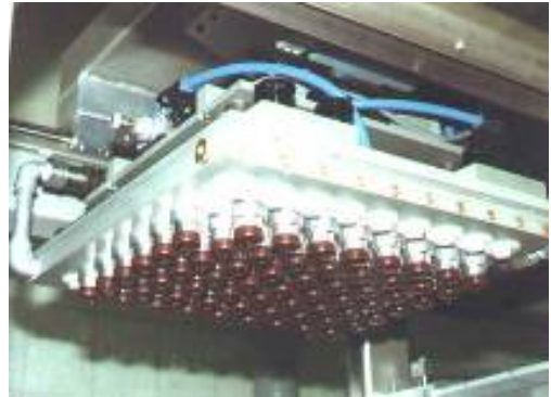
STAMP UNIT WITH SHELLS