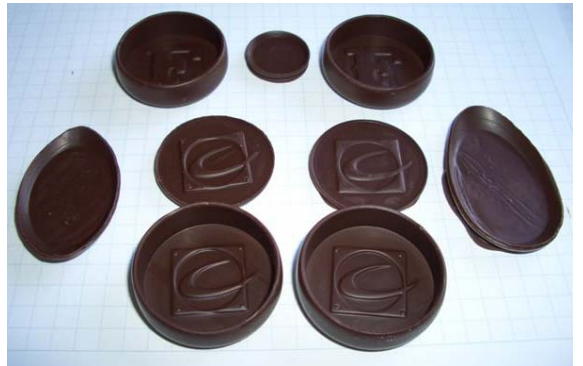
EXAMPLE OF SHELLS MADE ON THE CHOCOTECH FROZEN SHELL HFM