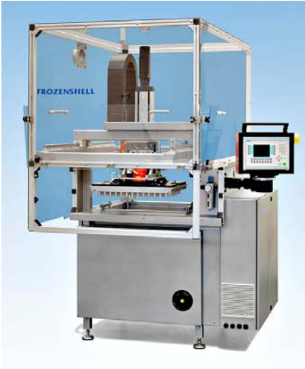
CHOCOTECH FROZEN SHELL HFM

A complete FROZENSHELL LINE is available for customer trials in our CHOCOLATE LAB in Wernigerode.